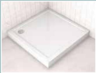
Option 3 Raised above the floor

Zamori offers optional adjustable legs and panel sets for raising the tray 100mm above the floor. This allows for easy access to any plumbing, and is often the preferred option when retro fitting a new tray into an existing location. The packs include removeable acrylic side panels to match the shower tray. These are held in place by magnetic clips to ensure maintenance is easy.