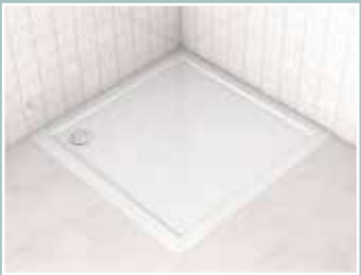
Option 2 Sunk into the floor

The low 35mm height allows the tray to be sunk into the floor so that the upper surface is level with the floor. The framed rim still allows good water retention to avoid water escape, especially when combined with the self cleaning Vortex high flow shower waste (which clears up to 30 litres of water per minute).