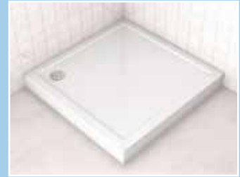
Option 3 Raised above the floor

Zamori offers optional adjustable legs and panel sets for raising the tray 100mm above the floor. This allows for easy access to any plumbing, and is often the preferred option when retro fitting a new tray into an existing location. The packs include removeable acrylic side panels to match the shower tray. These are held in place by magnetic clips to ensure maintenance is easy.