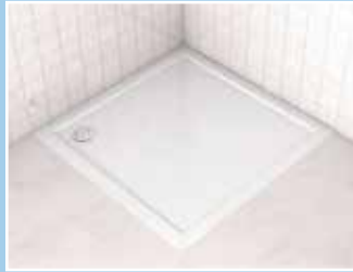
Option 2 Sunk into the floor

The low 35mm height allows the tray to be sunk into the floor so that the upper surface is level with the floor. The framed rim still allows good water retention to avoid water escape, especially when combined with the self cleaning Vortex high flow shower waste (which clears up to 30 litres of water per minute).